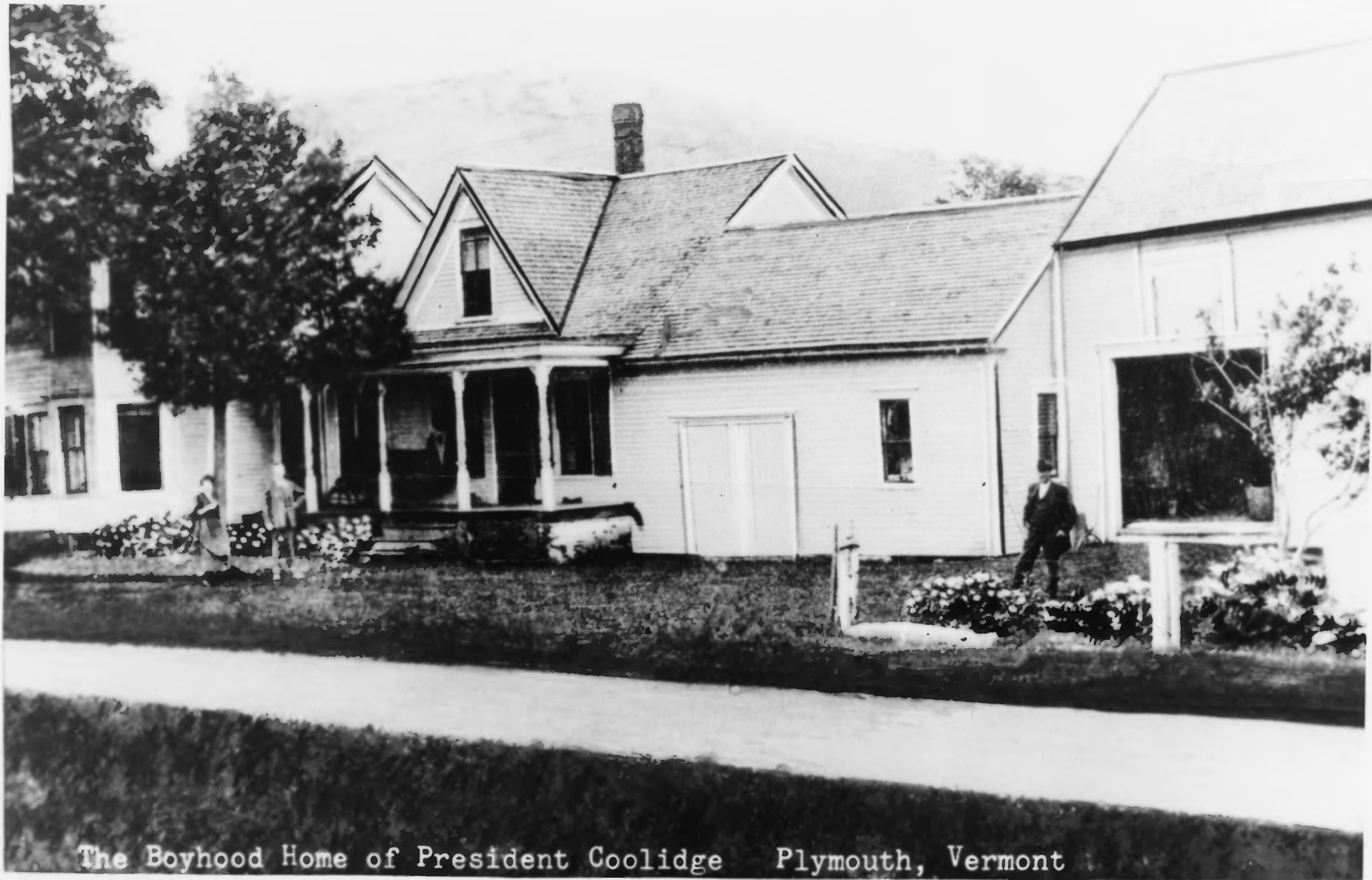
The Boyhood Home of President Coolidge Plymouth, Vermont